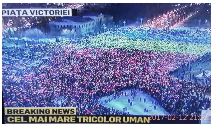
Fig.3 The largest human flag at the Victoriei Square protests on February 12, 2017

I will add to the above my first contact with real Democratic values on the occasion of the Democratic Convention campaign in support of President Clinton's election, in 1992 when I happened to be in New York.