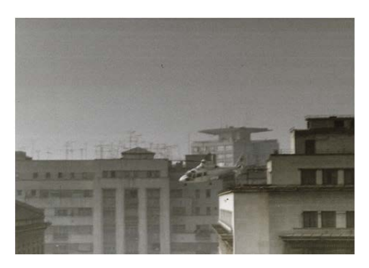
Fig.2 Ceausescu's escape with the helicopter on the roof of the building of the Central Committee of the Romanian Communist Party, December 22, 1989

Square (named "University Square" phenomenon or "Golaniada" movement); the "Mineriada" (13-15 June 1990,