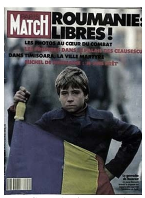
Gavroche de Roumanie in Paris Match